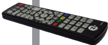
ZvSync Remote Control