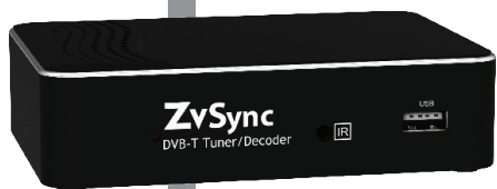
ZvSync Front View