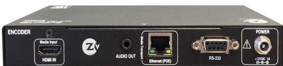
ZyPerHD Encoder ZyPerHD-E