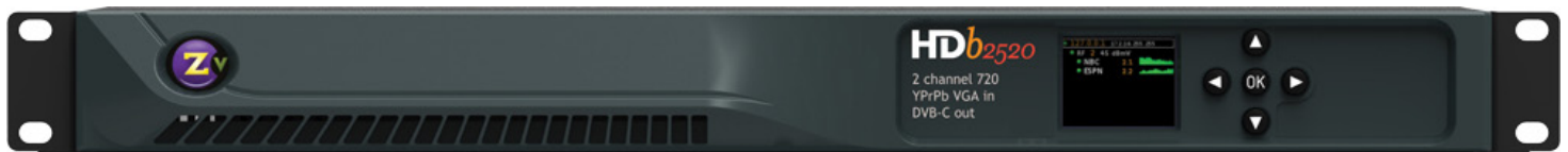
Color LED Screen Directional Controls

HDb2520-NA is an HD video encoder/QAM modulator with two DIN inputs for up to 720p Component video/digital and analog audio or VGA video/analog audio. MPEG-2 QAM RF output. Closed Captions supported on composite input. Includes two Hydra 3-foot component breakout cables, rack ears, and a power cord. VGA cables are sold separately. NOTE: These modulators will not work with DirecTV H26K satellite receivers.