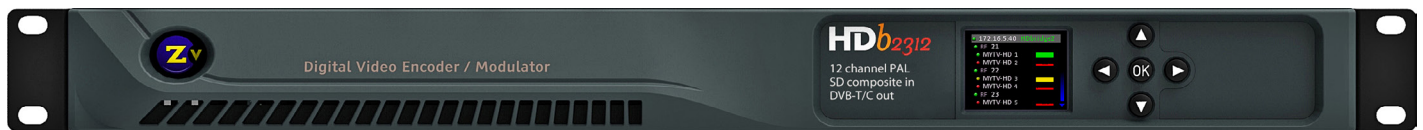
Color LED Screen Directional Controls

The HDb2312-EU is a Standard Definition (SD) video encoder & DVB-T/C modulator with 12 composite video/analog 3.5mm audio inputs. MPEG-2 DVB-T/C RF output via 12 digital channels using two sets of paired RF frequencies.